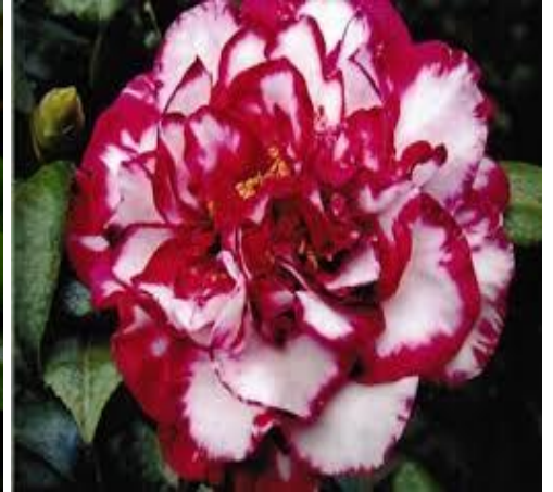
BEV PIET'S SMILE