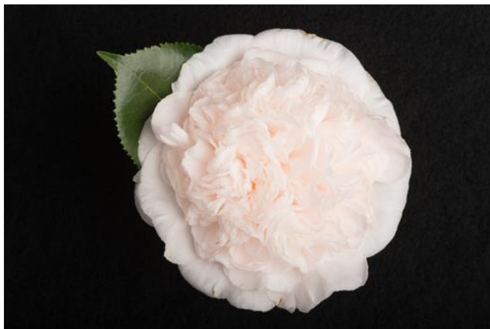
HENRY E. HUNTINGTON